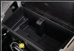
Under Hood Dry Storage

Built tough for trails, and rough for ranges, the compact KYMCO UXV 450i is powered by an EFI-fed, 443cc compact engine that's tuned for peak performance, the UXV 450i's virtue is versatility. All UXV 450i models now feature a shifter gate, to ensure the desired gear is always selected. The UXV 450i's compact chassis is easy to maneuver and it rolls right into most full-sized pickup trucks. The KYMCO UXV 450i's cab features a bench seat, tilt steering wheel, provides the driver and passengers easy, fast access in and out of the vehicle. This mid-sized draught horse has a 440-lb. capacity, gas assist, rear dump bed, and built-in tailgate storage. It sits with outstanding ground clearance and class-leading front and rear independent suspension for smooth, sure-footed handling over any outdoor surfaces. For rough and rugged terrain, shift from 2WD to 4WD with differential lock for a sure-footed drive. Built for serious play or hard work, the UXV 450i is an outstanding value for its features and quality. Available in Black, Blue or Red.