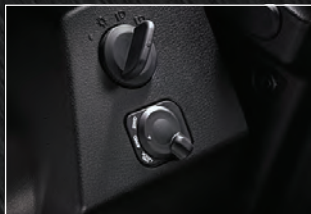
2WD/4WD & Diff Lock