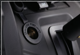
Interior 12V DC Outlet